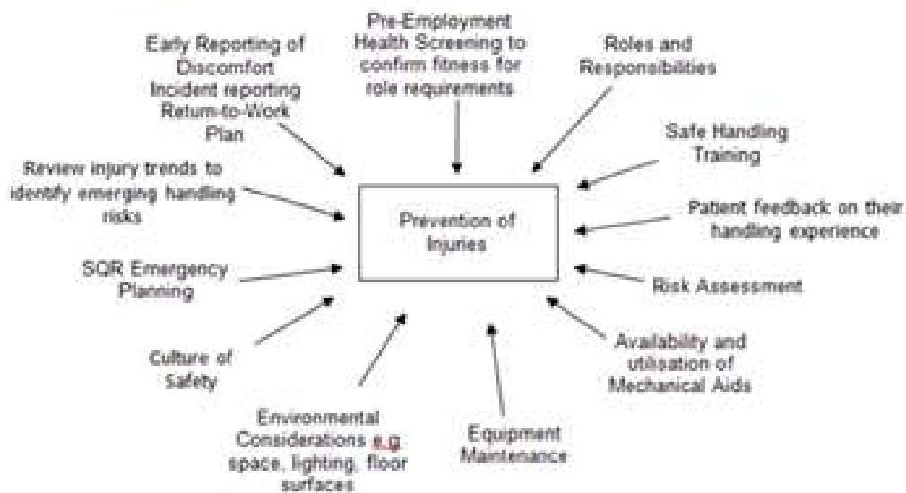
TABLE 1 Multi-faceted approach to injury prevention

The LITEN UP moving and handling programme incorporates a multi-faceted approach to ensure Southern Cross Healthcare provide a safe workplace environment for workers and patients and workers are aware of their responsibilities.